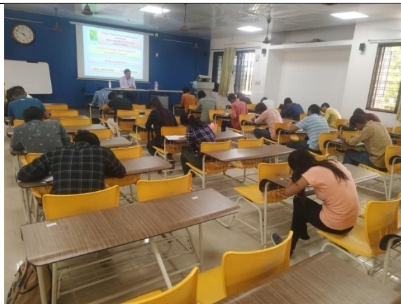
Essay writing Competition