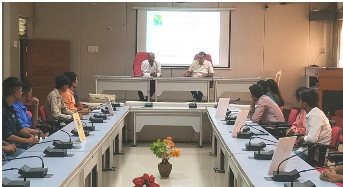
Group Discussion Competition